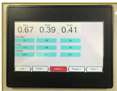
Current panel with Micro X7