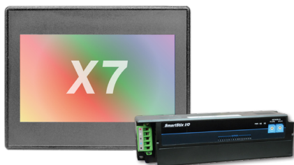
Horner Micro X7 controller and SmartStix