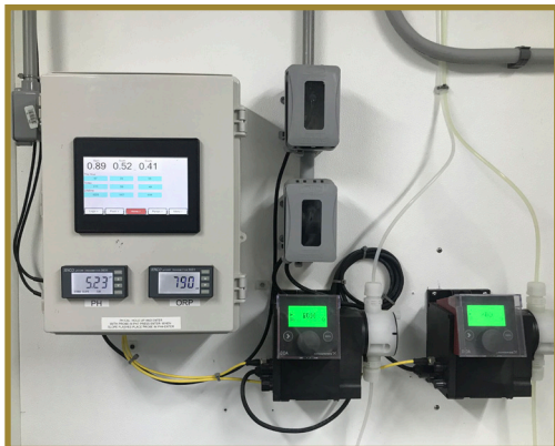
Current operator panel showing X7