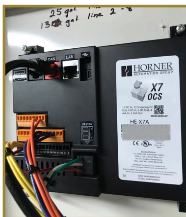
Backside of X7 inside panel