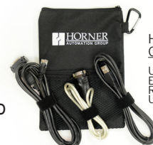
HE-XCK Programming Cable Kit Includes

USB Cable Ethernet Cable RS-232 Cable USB/RS-232 Adapter