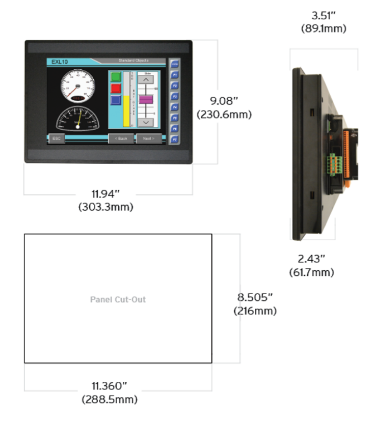
* +/- 0.1mm cutout tolerance