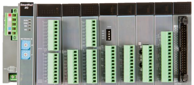
HE599CNX100, with 8 I/O modules installed