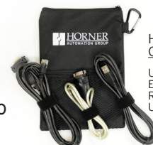
HE-XCK Programming Cable Kit Includes

USB Cable Ethernet Cable RS-232 Cable USB/RS-232 Adapter